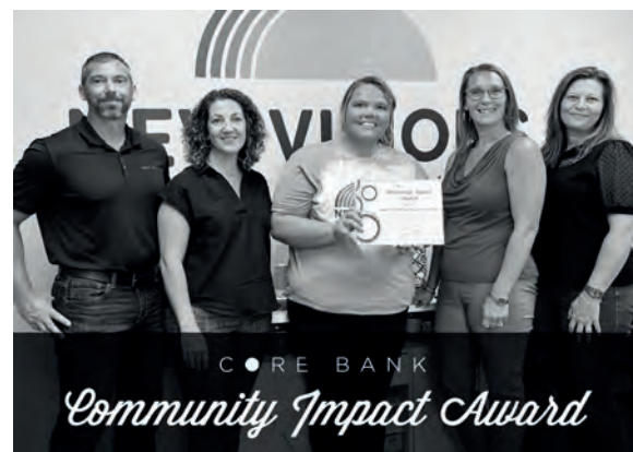
Recipient of the CORE Bank Community Impact Award