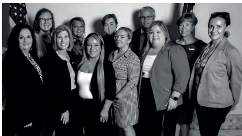
National Alliance to End Homelessness Conference in Washington DC