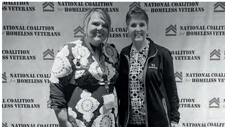
National Coalition for Homeless Veterans in Washington DC