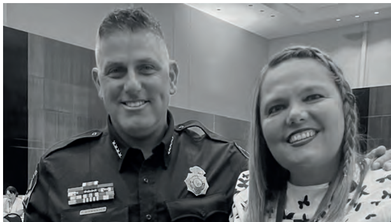
Co-Responder conference strengthening community relationship - OPD Chief of Police