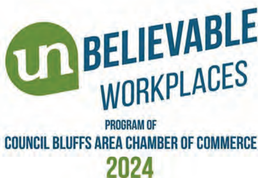
For the second consecutive year, NVHS named an Unbelievable Workplace by the Council Bluffs Chamber of Commerce